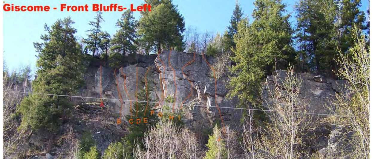
A. Eaglet One 5.7 TR 8m.

The Front Bluffs loom directly above the Roadside bluffs and are accessed by a trail through the boulderfield to the west or by bushwacking from Dance Park. This cliff is steeper with both sport and traditional routes.