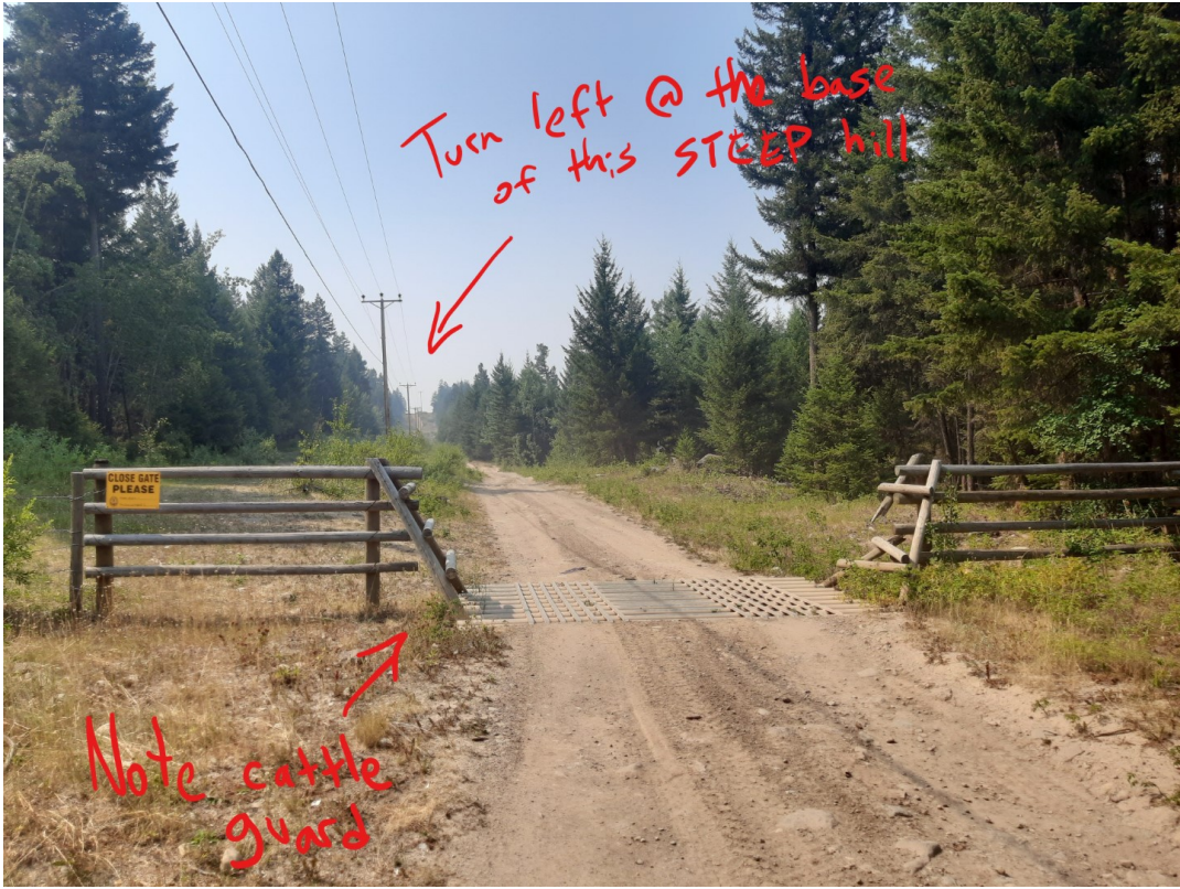
Obvious Left turn: